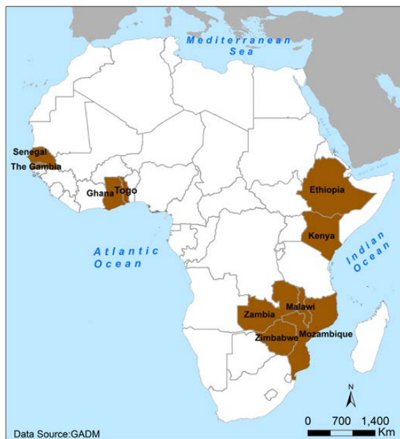
Figure 2. Ten African Country Case Studies

predicated on disaster risk but nevertheless form the backbone of a country’s ability to cope in the event of a disaster. An understanding of relevant spending in these areas must often be estimated through imprecise information from state and non-state actors involved in disaster-related activities.